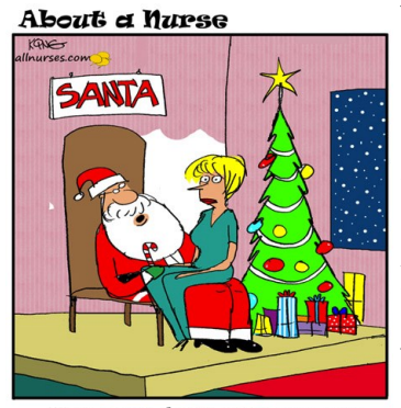
"I'm sorry, but I can't give you holidays off, or a social life. Would you settle for a candy cane?"

It is hard to believe it, election time has come and gone, Thanksgiving is full swing, Black Friday shopping began months ago, and the Winter Holidays are fast approaching. WOW Mid-