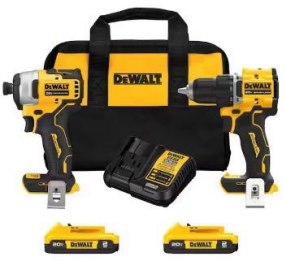
Power Tool Combo Kit